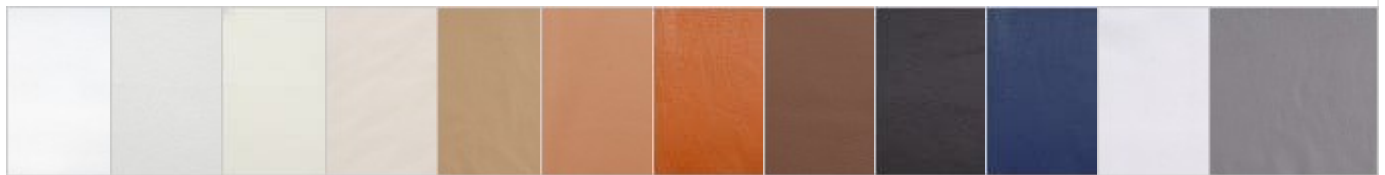
Porcelain White L201 Alpine White L203 Beige White L211 Sandstone L215 Driftwood Tan L219 Terra Brown L224 Golden Tan L227 Saddle Brown L231 Espresso Brown L235 Navy Blue L237 Nimbus Gray L238 Cloud Gray L239