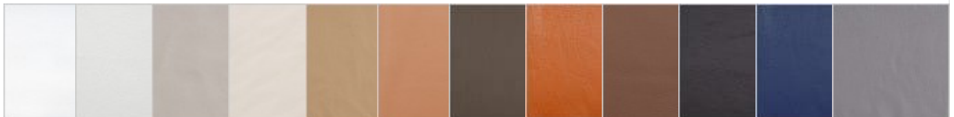
Porcelain White L201 Alpine White L203 Buff Tan L213 Sandstone L215 Driftwood Tan L219 Terra Brown L224 Taupe L229 Golden Tan L227 Saddle Brown L231 Espresso Brown L235 Navy Blue L237 Cloud Gray L239