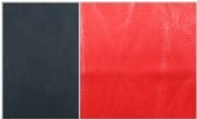
Premium Black L244 Premium Red L247