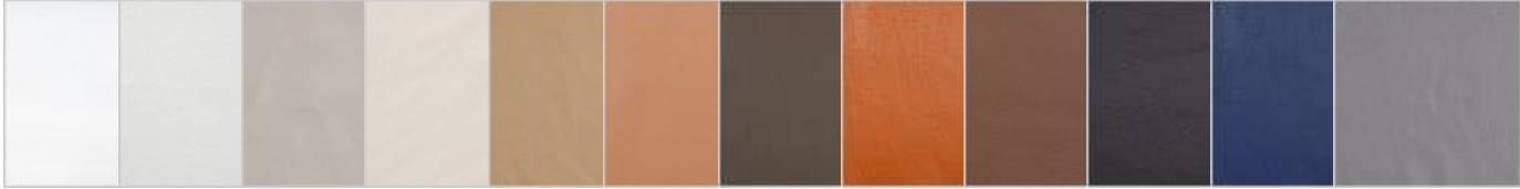
Porcelain White L201 Alpine White L203 Buff Tan L213 Sandstone L215 Driftwood Tan L219 Terra Brown L224 Taupe L229 Golden Tan L227 Saddle Brown L231 Espresso Brown L235 Navy Blue L237 Cloud Gray L239