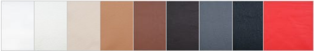
Arctic White L101 Polar White L103 Parchment L115 Earth Tan L124 Cocoa Brown L131 Java Brown L135 Charcoal Gray L139 Standard Black L143 Standard Red L147