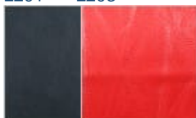
Premium Black L244 Premium Red L247