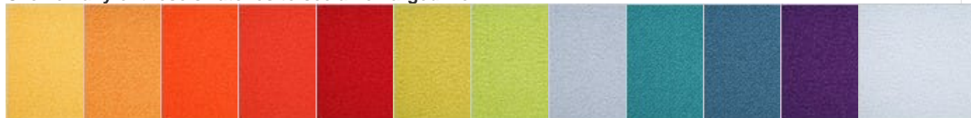
Citrus Yellow F216 Melon Orange F234 Tangerine Orange F235 Poppy Orange F236 Cayenne Red F223 Chartreuse Green F245 Lime Green F246 Powder Blue F253 Aegean Blue F254 Indigo Blue F256 Plum Purple F257 Silver Gray F262

Click on any of these swatches to see an enlarged view.