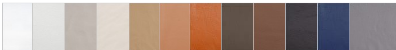
Porcelain White L201 Alpine White L203 Buff Tan L213 Sandstone L215 Driftwood Tan L219 Terra Brown L224 Golden Tan L227 Taupe L229 Saddle Brown L231 Espresso Brown L235 Navy Blue L237 Cloud Gray L239