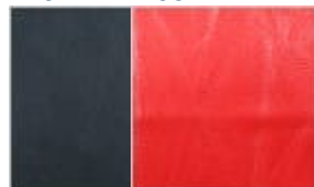
Premium Black L244 Premium Red L247

Product URL: https://www.modernclassics.com/store/pc/Corbusier-Style-Basculant-Chair-Leather-2p74.htm