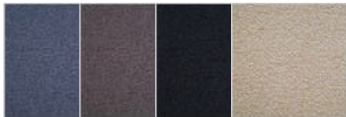
Winter Gray F264 Mica Gray F265 Midnight Black F266 Putty Tan F273

Product URL: https://www.modernclassics.com/store/pc/Web-Special-Florence-Knoll-Lounge-Chair-Shiny-Black-Leather-with-Buttons-26p38450.htm