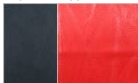
Premium Black L244 Premium Red L247

Product URL: https://www.modernclassics.com/store/pc/Mies-van-der-Rohe-Style-Executive-Flat-Arm-Side-Chair-with-Armpads-42p49390.htm