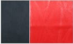
Premium Black L244 Premium Red L247