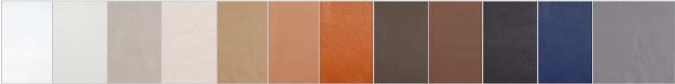
Porcelain White L201 Alpine White L203 Buff Tan L213 Sandstone L215 Driftwood Tan L219 Terra Brown L224 Golden Tan L227 Taupe L229 Saddle Brown L231 Espresso Brown L235 Navy Blue L237 Cloud Gray L239