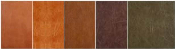
Harvest Tan L523 Caramel Tan L527 Clay Brown L531 Rich Brown L535 Olive Green L551

Mr. Platner, who worked in the firms of Eero Saarinen and Kevin Roche in the early and mid-1960's, introduced his collection of chairs, ottomans and tables in 1966. Known as the "Platner Collection", in the original design, each piece glass rests on a sculptural base of nickel-plated steel rods resembling a shiny sheaf of wheat. Platner designed both the structure and the production method for these designs, forming his primary contribution to the mid-century modern furniture movement and is still an enduring icon of 1960's Modernism.