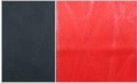
Premium Black L244 Premium Red L247

Here are the wood finish choices that are available for this item. Click on any of these swatches to see an enlarged view.