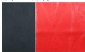
Premium Black L244 Premium Red L247

Product URL: https://www.modernclassics.com/store/pc/Corbusier-Style-Grande-Sofa-5p12.htm