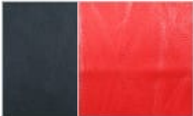
Premium Black L244 Premium Red L247