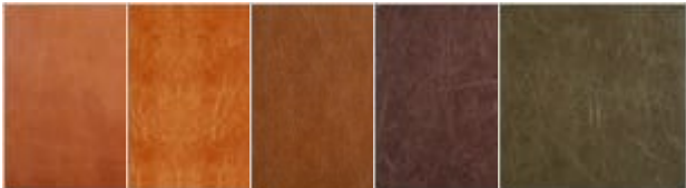
Harvest Tan L523 Caramel Tan L527 Clay Brown L531 Rich Brown L535 Olive Green L551