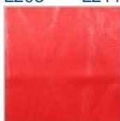
Premium Red Price Level 2 L247