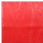
Premium Red Price Level 2 L247