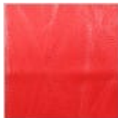
Premium Red Price Level 2 L247