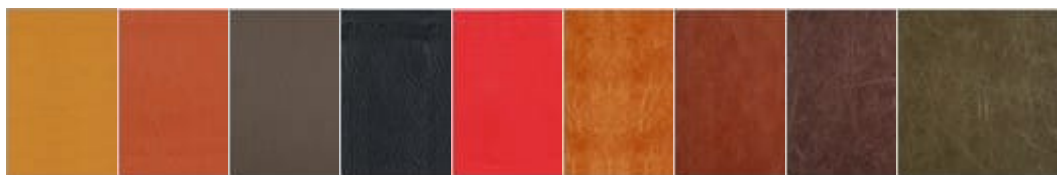
Camel Tan L427 Tuscany Brown L431 Taupe Grey L439 Black Leather (Grade 3) L443 Red Leather (Grade 3) L447 Caramel Tan L527 Saddle Brown L531 Rich Brown L535 Olive Green L551