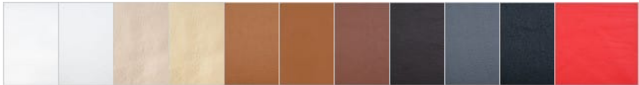
Arctic White L101 Polar White L103 Parchment L113 Cafe au Lait L115 Autumn Tan L123 Fall Tan L323 Cocoa Brown L131 Java Brown L1135 Charcoal Gray L139 Standard Black L143 Standard Red L147