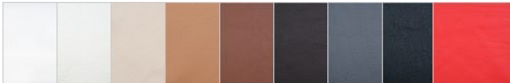
Arctic White L101 Polar White L103 Parchment L113 Earth Tan L124 Cocoa Brown L131 Java Brown L135 Charcoal Gray L139 Standard Black L143 Standard Red L147