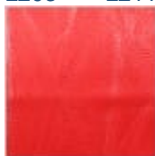
Premium Red Price Level 2 L247