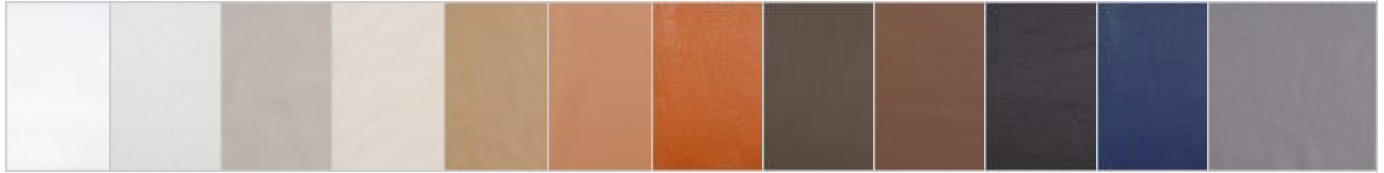
Porcelain White L201 Alpine White L203 Buff Tan L213 Sandstone L215 Driftwood Tan L219 Terra Brown L224 Golden Tan L227 Taupe L229 Saddle Brown L231 Espresso Brown L235 Navy Blue L237 Cloud Gray L239