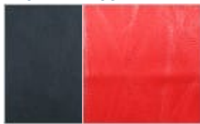
Premium Black L244 Premium Red L247