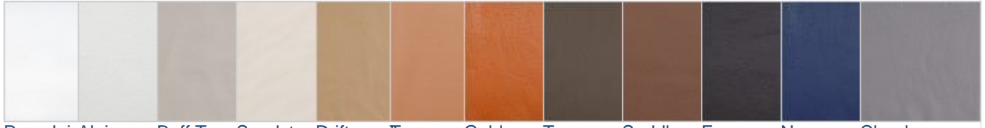
Porcelain White L201 Alpine White L203 Buff Tan L213 Sandstone L215 Driftwood Tan L219 Terra Brown L224 Golden Tan L227 Taupe L229 Saddle Brown L231 Espresso Brown L235 Navy Blue L237 Cloud Gray L239