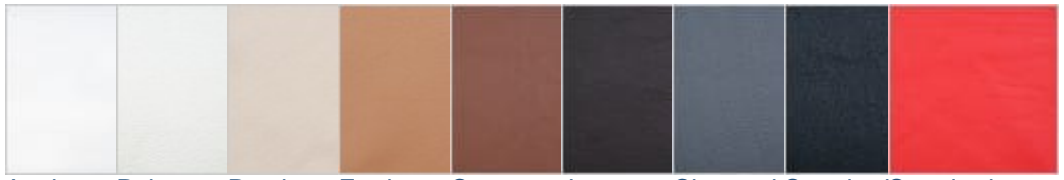
Arctic White L101 Polar White L103 Parchment L115 Earth Tan L124 Cocoa Brown L131 Java Brown L135 Charcoal Gray L139 Standard Black L143 Standard Red L147