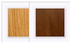
Light Ash Finish #W06 Dark Ash Finish #W13

Modern Classics Furniture offers up to five colors of wood finish, depending on the product, featuring North American Red Oak or Ash. We are happy to mail you a wood finish sample so you can see it first hand.